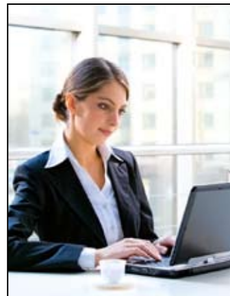
Give your staff the data they need for informed decision making with FRx.

The need for financial accountability is greater than ever—driven by standards such as Sarbanes-Oxley. Financial reports should no longer be simply printed and filed until audit or tax time. Included with every Sage MAS 90 ERP General Ledger is Microsoft FRx Report Designer (FRx), an industry-standard financial reporting tool. Taking full advantage of FRx, you can share information and encourage fiscal responsibility at all levels of the organization. It is easy to build and format financial reports within FRx. In this article, we'll cover tips for getting the most out of FRx and then we'll take a brief look at the add-on solutions available for FRx, including templates from Sage Extended Solutions.